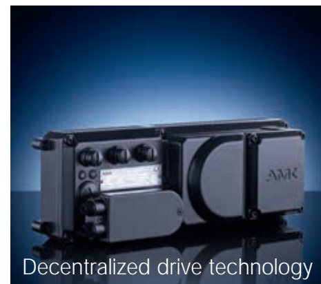
Decentralized drive technology

AMKSMART decentralized drive technology makes modular machines possible and reduces the control cabinet volume, cabling effort, and costs for connectors and cables.